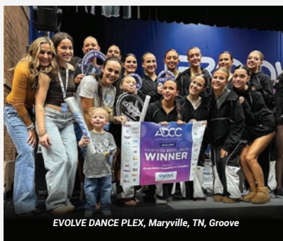
EVOLVE DANCE PLEX, Maryville, TN, Groove