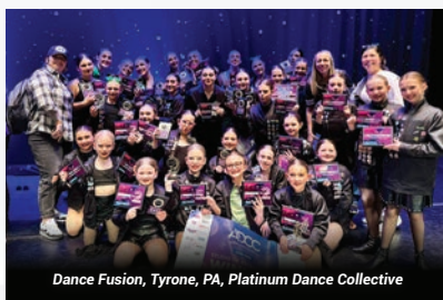
Dance Fusion, Tyrone, PA, Platinum Dance Collective