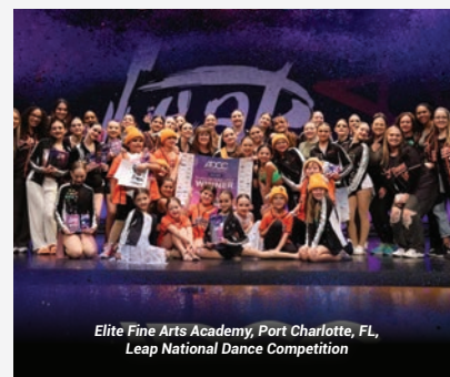
Elite Fine Arts Academy, Port Charlotte, FL, Leap National Dance Competition