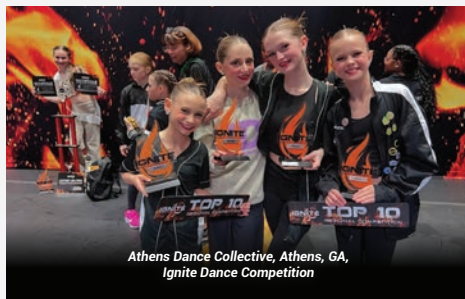
Athens Dance Collective, Athens, GA, Ignite Dance Competition