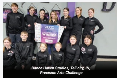
Dance Haven Studios, Tell city, IN, Precision Arts Challenge