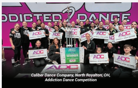
Caliber Dance Company, North Royalton, OH, Addiction Dance Competition