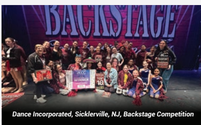
Dance Incorporated, Sicklerville, NJ, Backstage Competition