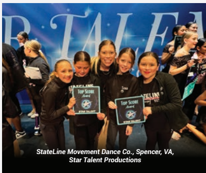
StateLine Movement Dance Co., Spencer, VA, Star Talent Productions