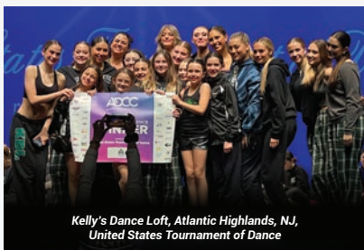
Kelly's Dance Loft, Atlantic Highlands, NJ, United States Tournament of Dance