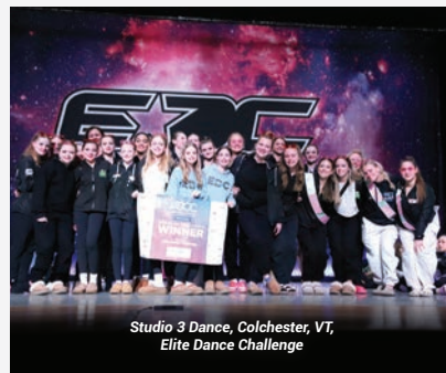
Studio 3 Dance, Colchester, VT, Elite Dance Challenge