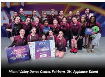
Miami Valley Dance Center, Fairborn, OH, Applause Talent