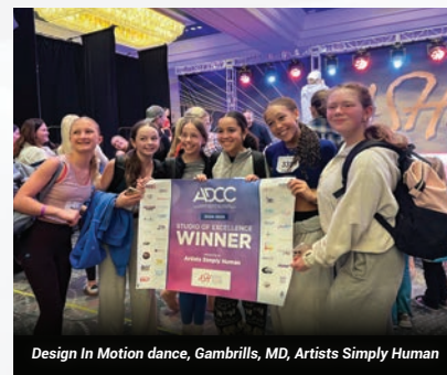
Design In Motion dance, Gambrells, MD, Artists Simply Human