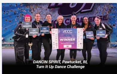
DANCIN SPIRIT, Pawtucket, RI, Turn It Up Dance Challenge