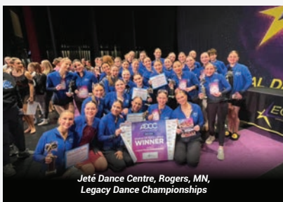
Jeté Dance Centre, Rogers, MN, Legacy Dance Championships