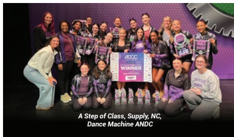
A Step of Class, Supply, NC, Dance Machine ANDC