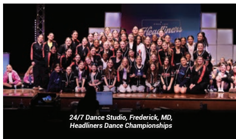
24/7 Dance Studio, Frederick, MD, Headliners Dance Championships

Since 2014, ADCC Members have presented 11,000+ ADCC Studio of Excellence Awards (SOE) at their regional and national competitions, recognizing one studio that exemplifies the values of the ADCC , including working together and striving for excellence.