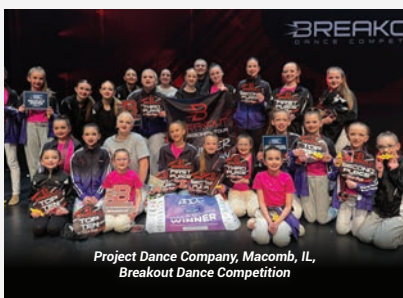
Project Dance Company, Macomb, IL, Breakout Dance Competition