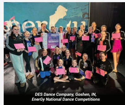
DES Dance Company, Goshen, IN, EnerGy National Dance Competitions