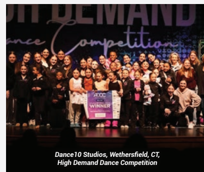
Dance10 Studios, Wethersfield, CT, High Demand Dance Competition