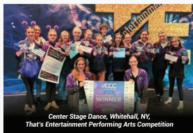
Center Stage Dance, Whitehall, NY, That's Entertainment Performing Arts Competition