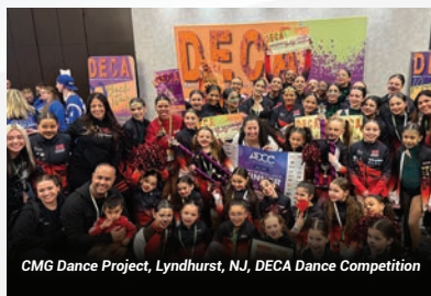
CMG Dance Project, Lyndhurst, NJ, DECA Dance Competition