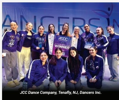
JCC Dance Company, Tenafly, NJ, Dancers Inc.