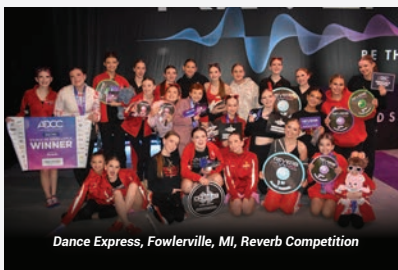
Dance Express, Fowlerville, MI, Reverb Competition