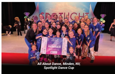
All About Dance, Minden, NV, Spotlight Dance Cup