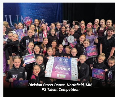
Division Street Dance, Northfield, MN, P3 Talent Competition