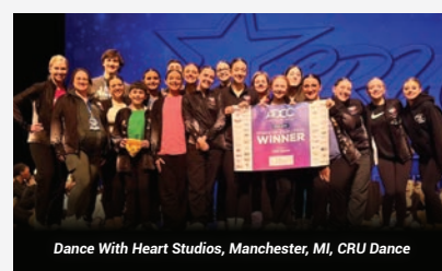
Dance With Heart Studios, Manchester, MI, CRU Dance