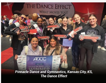
Pinnacle Dance and Gymnastics, Kansas City, KS, The Dance Effect